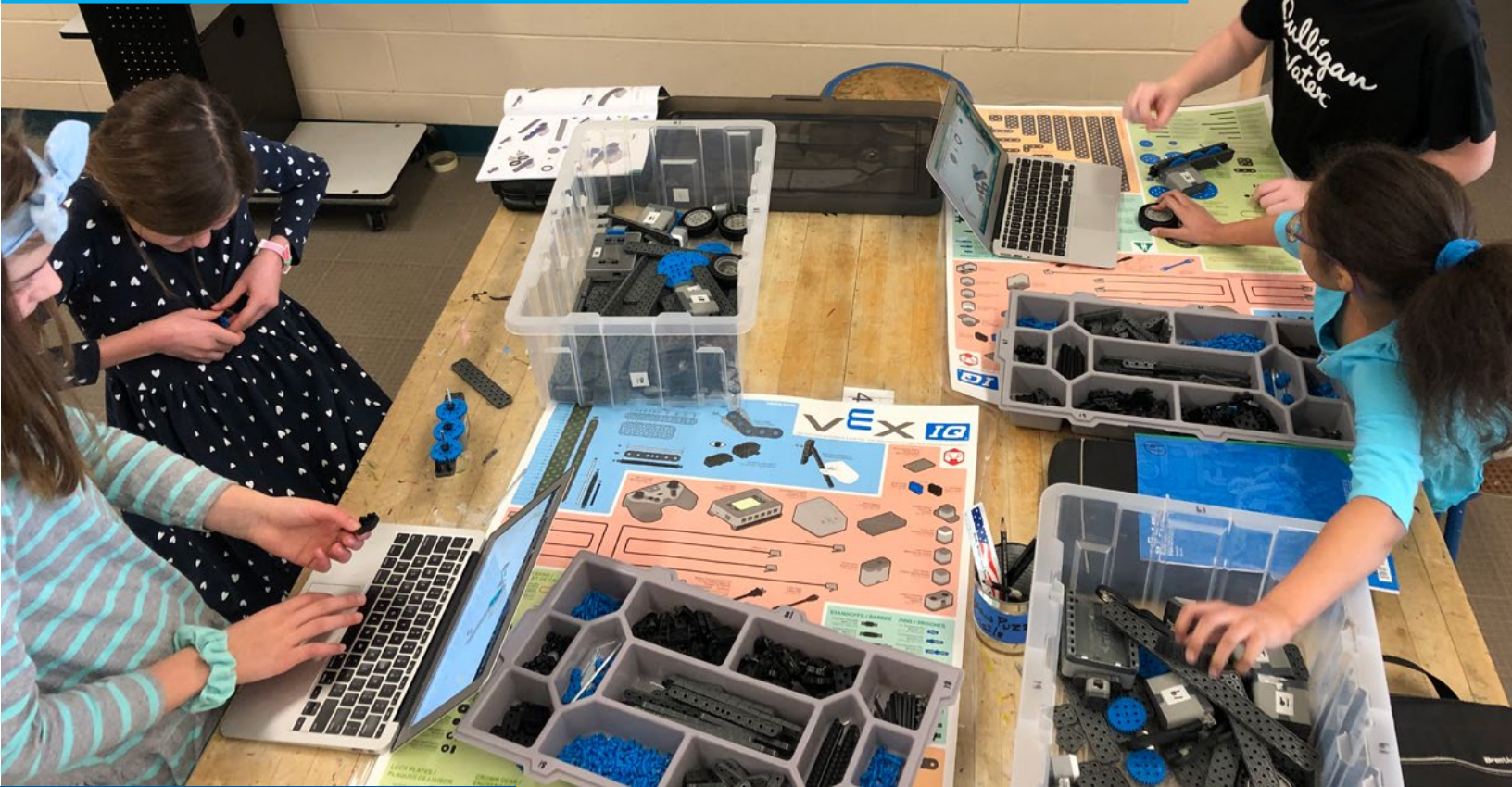
Robotics Grant: Harrison Middle School 5th graders use VEX IQ robotics kits to build and code robots.