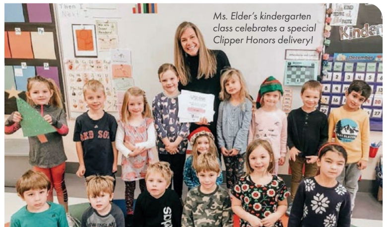
Ms. Elder's kindergarten class celebrates a special Clipper Honors delivery!