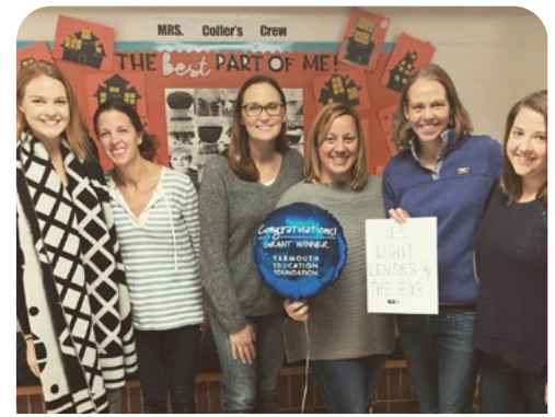
The Light, Lenses & Eye applicants receive their grant award

Thanks to the support of donors and volunteers, YEF continued our mission of promoting and enhancing innovative education for Yarmouth students by awarding grants during the 2019 fiscal year totaling approximately $49,800.