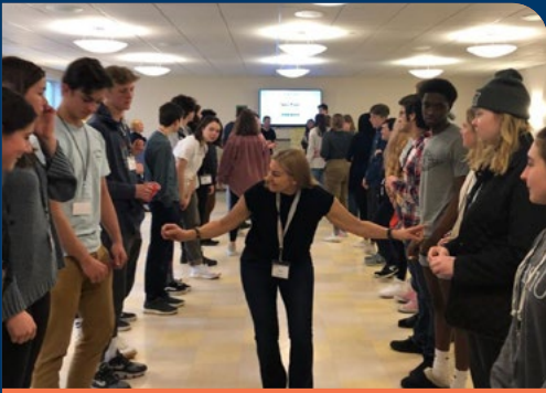
YHS students participate in a Boys to Men workshop

The YEF mission is to support innovation in education, and innovation is looking different during this pandemic. YEF has been here to help. Thank you to our administrators, teachers, and support staff for their hard work during this difficult time.