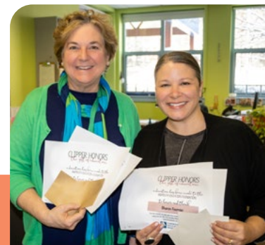
Above: Clipper Honors deliveries to the HMS front office staff; below: the YEF team prepares certificates and gifts

Our Clipper Honors Program provides an opportunity for parents or caregivers to thank, honor or congratulate an educator, administrator or bus driver through a donation to YEF. With a donation of $25 or more, YEF will also include a gift for the recipient. This year, YEF included gift certificates to local Yarmouth businesses, Maples & Clayton's Cafe.