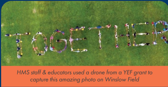
HMS staff & educators used a drone from a YEF grant to capture this amazing photo on Winslow Field

This exciting opportunity will help teach young students how to code, program, and fly drones. Besides computer science, students will work on math concepts like degrees of angles, velocity, measurement, and more. Students will also play a role in fixing the drone if their intended flight path doesn't quite work out! Drones are used everywhere today—from delivering packages to exploring the ocean—and Yarmouth students will be one step ahead.