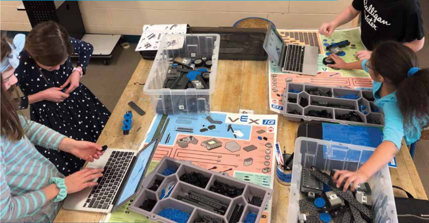
Robotics Grant: Harrison Middle School 5th graders use VEX IQ robotics kits to build and code robots.