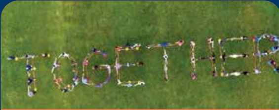
HMS staff & educators used a drone from a YEF grant to capture this amazing photo on Winslow Field

This exciting opportunity will help teach young students how to code, program, and fly drones. Besides computer science, students will work on math concepts like degrees of angles, velocity, measurement, and more. Students will also play a role in fixing the drone if their intended flight path doesn't quite work out! Drones are used everywhere today – from delivering packages to exploring the ocean – and Yarmouth students will be one step ahead.