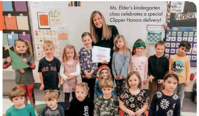
Ms. Elder's kindergarten class celebrates a special Clipper Honors delivery!