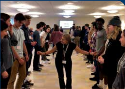
YHS students participate in a Boys to Men workshop

The YEF mission is to support innovation in education, and innovation is looking different during this pandemic. YEF has been here to help. Thank you to our administrators, teachers, and support staff for their hard work during this difficult time.