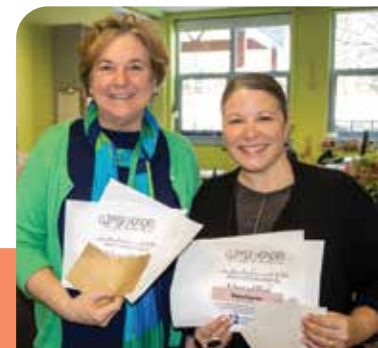
Above: Clipper Honors deliveries to the HMS front office staff; below: the YEF team prepares certificates & gifts

Our Clipper Honors Program provides an opportunity for parents or caregivers to thank, honor or congratulate an educator, administrator or bus driver through a donation to YEF. With a donation of $25 or more, YEF will also include a gift for the recipient. This year, YEF included gift certificates to local Yarmouth businesses, Maples & Clayton's Cafe.