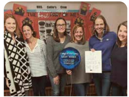
The Light, Lenses & Eye applicants receive their grant award

Thanks to the support of donors and volunteers, YEF continued our mission of promoting and enhancing innovative education for Yarmouth students by awarding grants during the 2019 fiscal year totaling approximately $49,800.