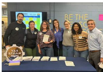
Some YEF Board members at STEAM Night

SINCE 2010, YEF HAS FUNDED NEARLY $600,000 IN GRANTS TO OUR SCHOOLS!