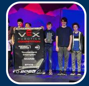
Robotics Club at HMS