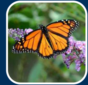
HMS Butterfly and Veggie Garden