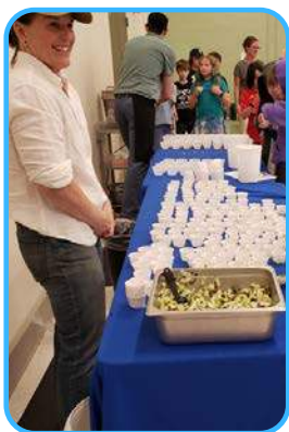
Wakami Gatherers interactive nutritional experience at YES

SINCE 2010, YEF HAS FUNDED NEARLY $600,000 IN GRANTS TO OUR SCHOOLS!