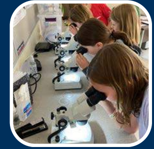
Stereo microscopes for Rowe & YES