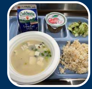
Wakami Gatherers lunch at YES