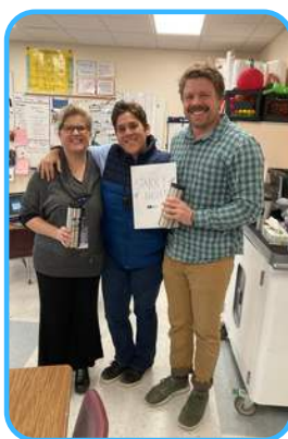
Starry Night grant being awarded to HMS 6th grade teachers